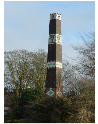
Clayton Brickworks Chimney